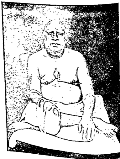
HIS DIVINE GRACE OM VISHNUPADA Puram in myra Sri Sri Sachchidananda Bhaktivinode Thakura